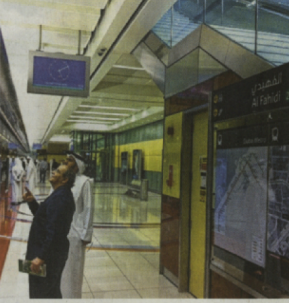
First impressions Guests at the Al Fahidi Station check out a route map on the Green Line.

ACHIEVEMENT Metro in Guinness World Records The Dubai Metro has entered the Guinness World Records registering its place as the longest driverless metro system in the world. His Highness Shaikh Mohammad Bin Rashid Al Maktoum, Vice-President and Prime Minister of the UAE and Ruler of Dubai, along with dignitaries and guests unveiled the record certificate at the opening ceremony at Healthcare City Station. Shaikh Mohammad took a ride on the Green Line and also toured five stations including Al Fahidi, Al Ghubaiba, Baniyas, Salahuddin and Etisalat. He unveiled several commemorative pieces at different stations. He unveiled a memorial plaque in the form of a tree with words written in Arabic saying, 'Thanks to Allah, we were able to transform the dream to reality, tangible actuality, and great achievement.' At Al Ghubaiba Station, which is a heritage station, he symbolically put in the last piece in a model of Dubai's public transport map. He then visited the Dubai Ferry and Water bus station at the creek. At Baniyas Station he unveiled the model of 'Twin Cities' highlighting the fact that Dubai has signed agreements with 19 cities. At Salah Al Deen Station, Shaikh Mohammad unveiled a metal globe model of the earth with coins of every country inscribed on it. He also placed a golden dirham featuring his own image on one side and the Dubai Metro on the other side. —AA