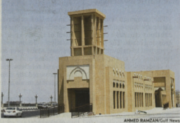
Heritage on show Al Ras station in Dubai which employs traditional architecture.

GULFNEWS.COM ON THE WEB For more pictures, reports and videos visit www.gulfnews.com